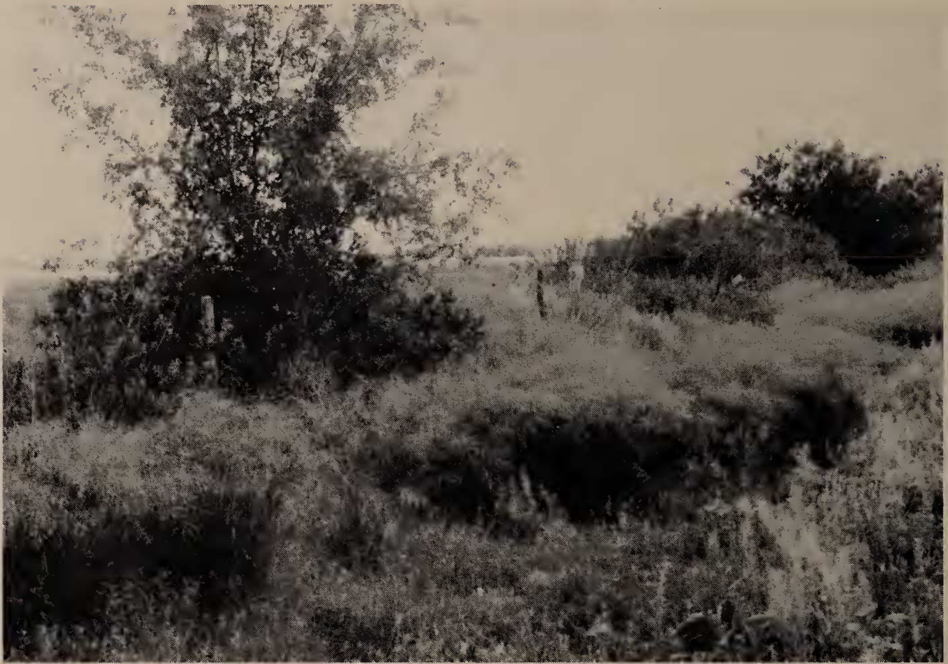
FIG. 4.—Hackberry-shrub community, south of Olton, Lamb County.